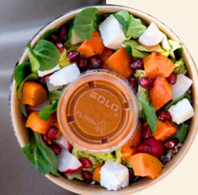
Sweet potato quinoa