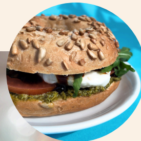
Tomato mozzarella pesto