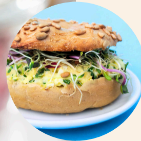
Bio egg salad