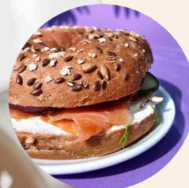
New York Lox